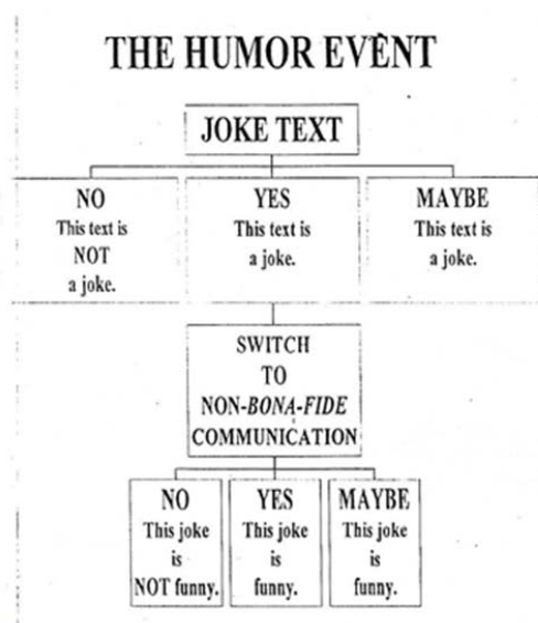
Fig. 3 Audience based theory where humor identification, comprehension and appreciation take place in the humor event [77]