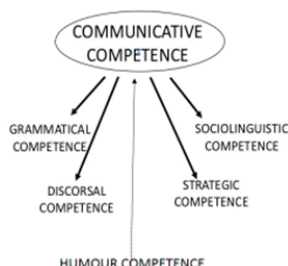
Fig. 4 Description of the humour competence added as a fifth component in communicative competence [35].