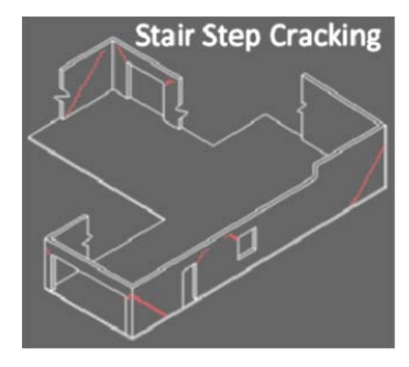
Fig. 1 Stair Step Crack Mapping

As previously discussed, the most common types of cracking manifest consist of stair step mortar joint cracking, horizontal joint cracking and vertical cracking. For purposes of analysis it is often helpful to map the locations and configurations of the cracking observed. This mapping serves to record the configuration, orientation and extent of propagation of the cracks manifest. See Figs. 1 and 2 for examples of crack mapping showing the types and common locations of cracking.