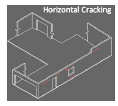
Fig. 2 Horizontal Crack Mapping