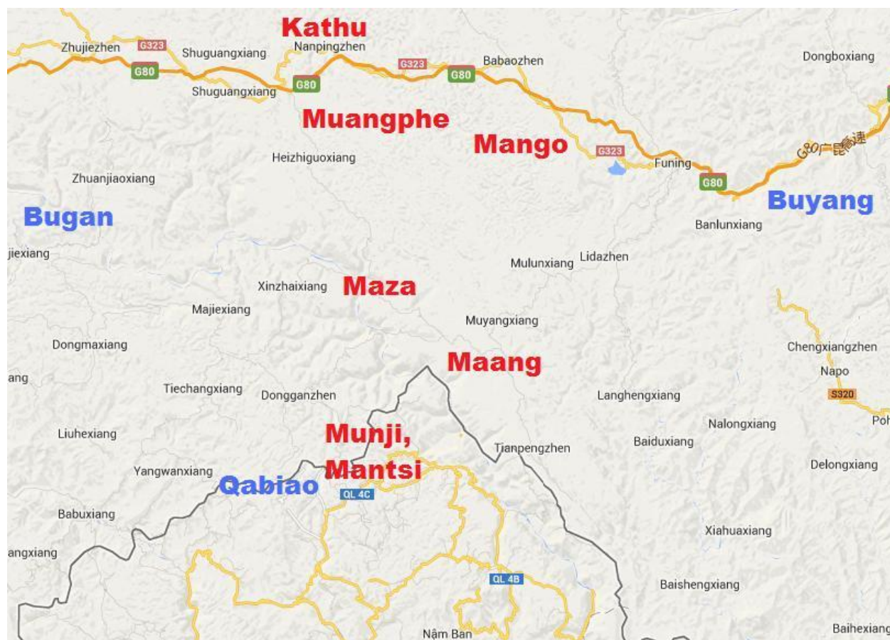
Figure 1. Distribution of Mondzish languages in the Sino-Vietnamese border region (Red: Mondzish languages; Blue: non-Tibeto-Burman minor languages)