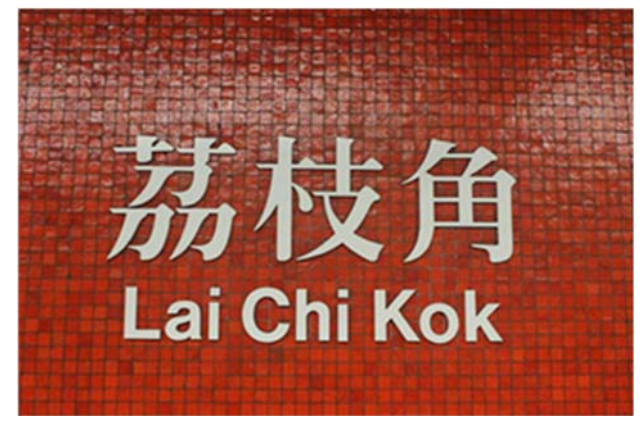
Fig. 1 One of the signs in the Hong Kong Mass Transit Railway [21]