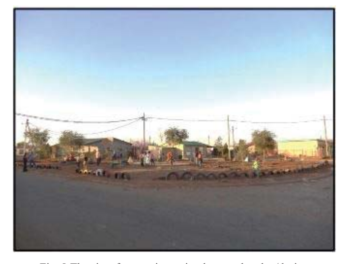
Fig. 8 The site after starting to implement the plan/design