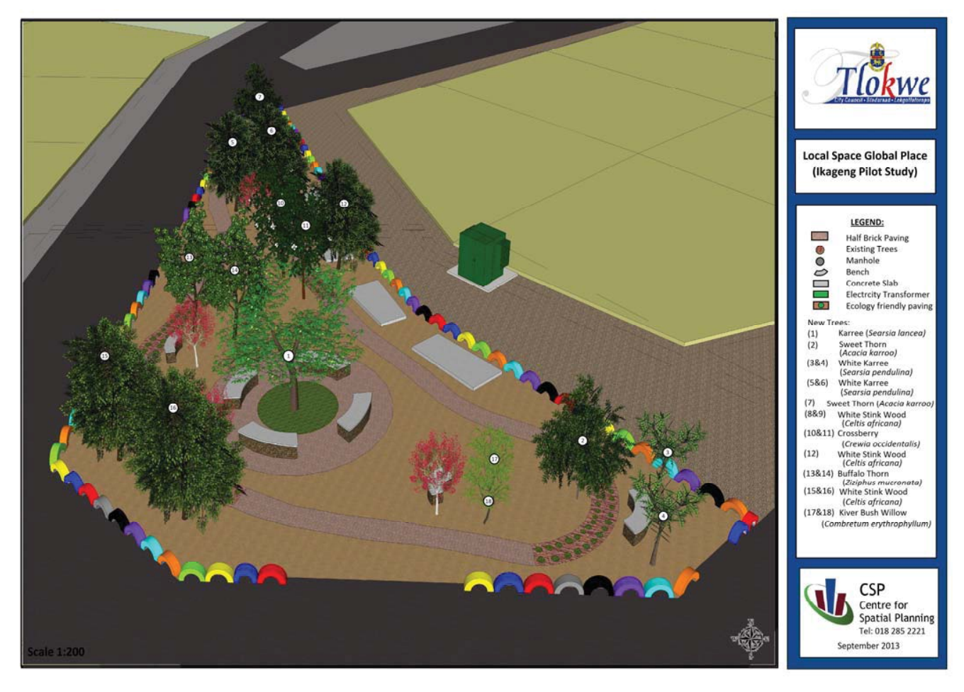
Fig. 6 Final design