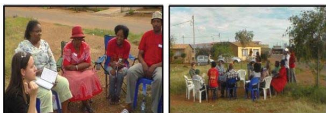
Fig. 3 On-site focus group 1

Phase one: First focus group. The aim of this focus group was to gain a holistic understanding of how the research setting was experienced by the community (Fig. 3). The focus group consisted of twenty participants whose ages vary between twenty-five and sixty. This larger group was divided into two smaller focus groups led by two facilitators, an urban planner and an urban ecologist, both team members of the LSGP project. Questions posted to initiate further discussion included: (i) how do you experience this site and surrounding area , (ii) how do you envision this site in the future , and (iii) based on the first and second question, how would you like to see the way forward?