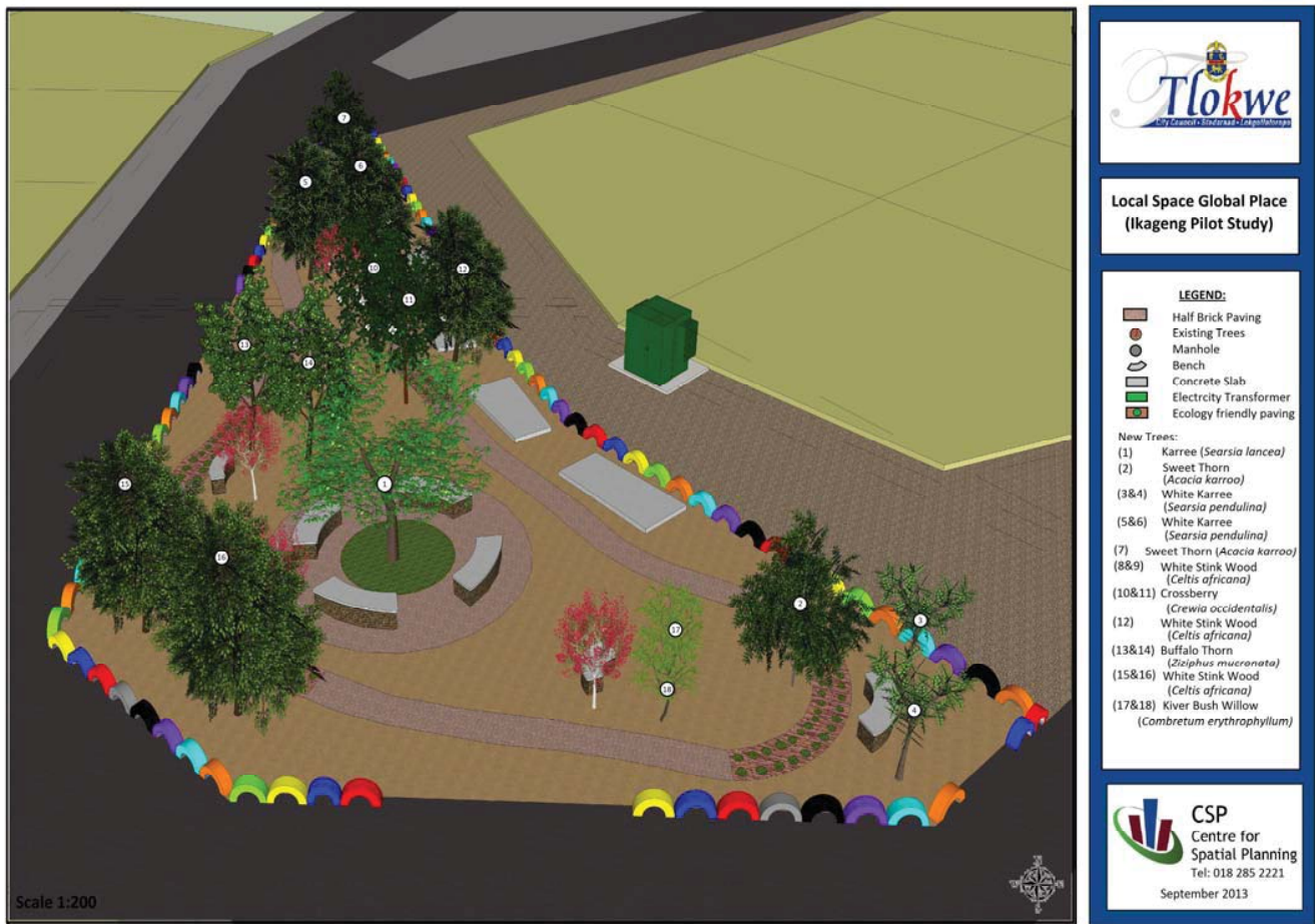
Fig. 6 Final design