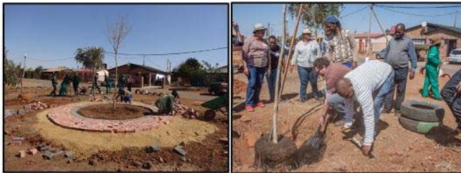
Fig. 7 During implementation