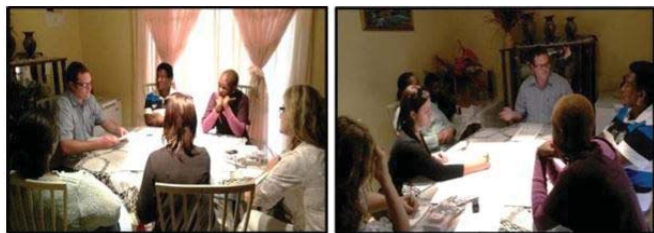
Fig. 9 Reflective focus group