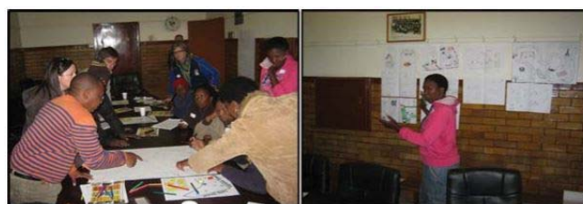
Fig. 5 Collaborative Design Workshop

Phase three: Collaborative design workshop. According to [58] a collaborative design workshop can only be successful when interactive teamwork is followed. Interactive teamwork is firstly based on proactive collaboration where a better outcome is achieved by the group, compared to what is possible by individual effort [59]. Before commencement of the workshop community members (core participants) were requested to develop spatial ideas on how they would see the space being transformed. Using visual data in this case serves as a way for community members to express themselves in other ways than verbal expressions. The individual drawings served as a point of departure for the workshop. From the individual ideas, collective design elements were selected as guidelines to inform the concept plan/design. During the second stage of the workshop a communal plan was negotiated and developed in a collective manner (Fig. 5). The workshop laid the foundation for further involvement of stakeholders such as the local municipality, academic researchers and other community members. From here various plans and designs were negotiated until a final plan/design was agreed upon (Fig. 6).