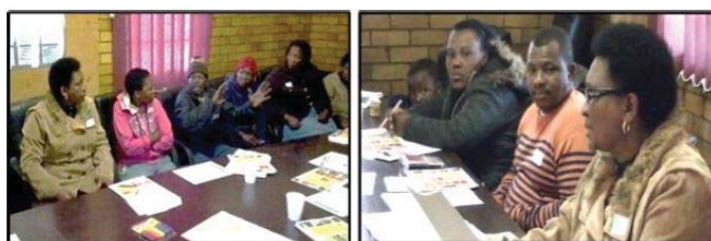
Fig. 4 Second focus group

Phase two: Second focus group. From the first focus group, a second core focus group was selected consisting of eleven participants between the ages of twenty-five and sixty and based on the following criteria (i) daily interaction with the site , (ii) living adjacent to the site , (iii) have been living close to the site for longer than five years and (iv) being able to express themselves verbally in English .