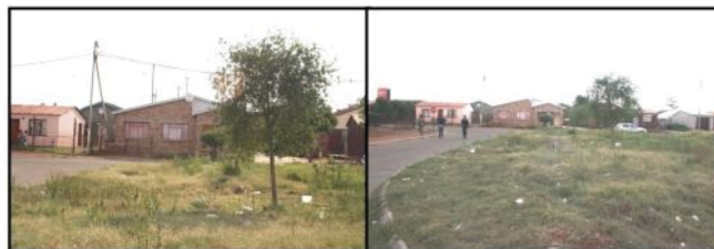
Fig. 2 Site before commencement of the research

Entrance to the community in this case study was gained through a Ward Committee member of Ward 6. In South Africa, wards are geopolitical subdivisions within a municipality (governing body of a town/city) that plays a crucial role in governing and managing local society [43]. The role of the Ward Committee is to improve the level of democratic public participation within the jurisdiction of a local government [44]. Ward Committee members are democratically elected by citizens as representatives of the people living in the specific ward. In this case the community was contacted with the assistance of the Ward Councillor (head of the Ward Committee and one of the Municipal Councillors). An open invitation was given to community members to attend an initial on-site focus group to discuss the transformation of the open space appointed for revitalisation (Fig. 2 – Site before commencement of the research).