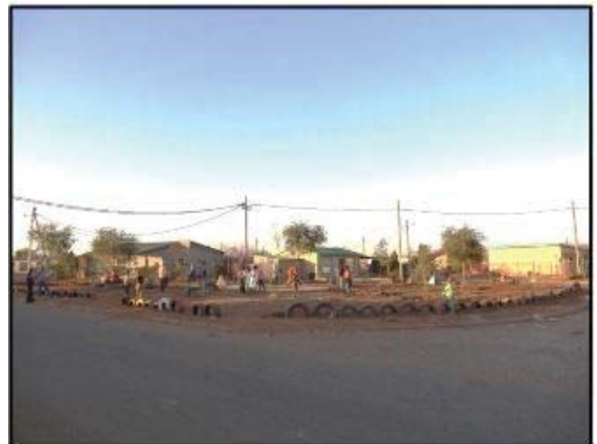
Fig. 8 The site after starting to implement the plan/design