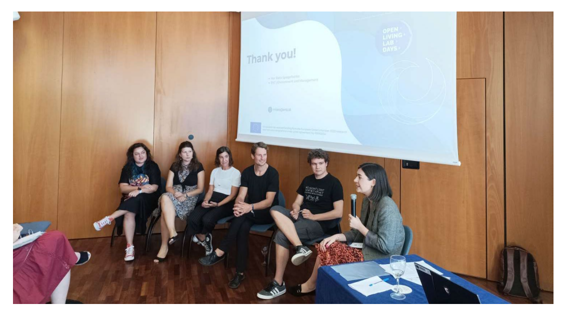
Figure 3: the panel discussion after the second session

The Living Labs also discussed the role of financial incentives to engage stakeholders. Most living labs agreed that this may not be a good idea, sharing some of the challenges that could hinder progress. For instance, acquiring sufficient funding can prove to be difficult; the final results/decisions can be negatively affected; and it fuels complicated expectations that potentially can disengage stakeholders when not met. Other living labs offered alternative pathways, such as tapping into volunteer groups, engaging with stakeholders who may be interested in the topic without financial incentives (such as citizen groups in Sligo, Ireland and officials in Oeiras, Portugal), and presenting the opportunity for stakeholder engagement on a key socially relevant issue as the 'advantage' itself.