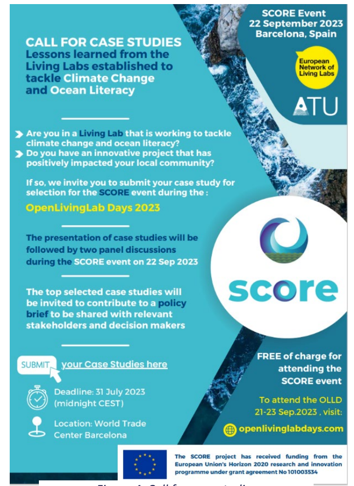
Figure 4: Call for case studies

Eventually, ten case studies were received and all of them were selected to be presented at the SCORE event during the OpenLivingLab Days 2023.