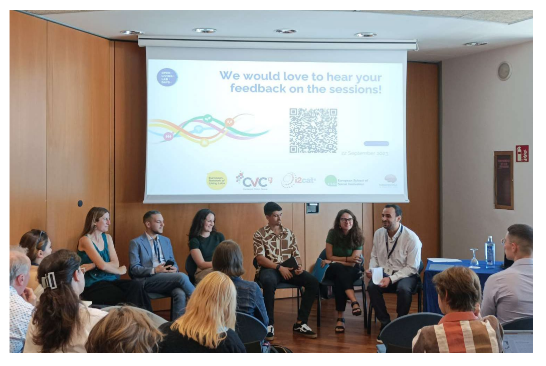
Figure 2: The panel discussion after the first session of the international workshop.

The participants also believed that the systematic approach and feedback loops, as well as the innovation and collaboration aspects, would be missed if Living Lab elements were removed from the project. These elements include observing concrete results from interactions, utilizing questionnaires, and filling forms with citizens and industry regarding their needs in order to ask for funding from their government. Additionally, citizen science activities, such as the analysis of images and data submitted by individuals, were subsequently analyzed.