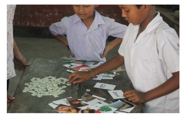
Fig. 1 Students playing the work recognition game

To play the game, lay the two sets of cards separately with the picture side of the card facing up and keep the alphabets in a pile nearby. The student has to first pick a card randomly from the Assamese set, recognise the picture, and then read it aloud. Then the student has to identify and pick the same picture card from the English set, read the alphabets individually first and then the word as a whole. Finally, the student has to identify and draw those alphabets from the pile and arrange them to write the word.