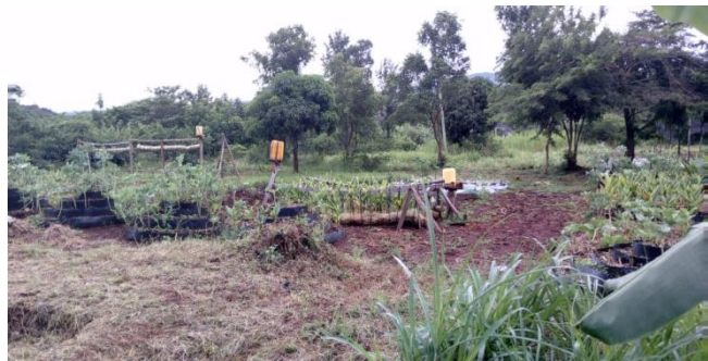
Plate 5. Cassava MH 95, improved variety and drought tolerant