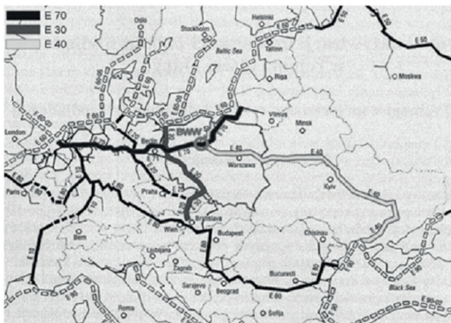
Figure 3. Bydgoszcz Water Junction in relation to the main water corridors in Europe

The Bydgoszcz Water Junction waterways are the Brda and the Vistula rivers as well as the Bydgoszcz Canal together with the so-called Old Bydgoszcz Canal. The Brda River (channeled section) and the Bydgoszcz Canal are classified as navigable inland waterways of class II. The Vistula River along the section running through Kujawy-Pomerania Province currently meets the parameters of class I and II.