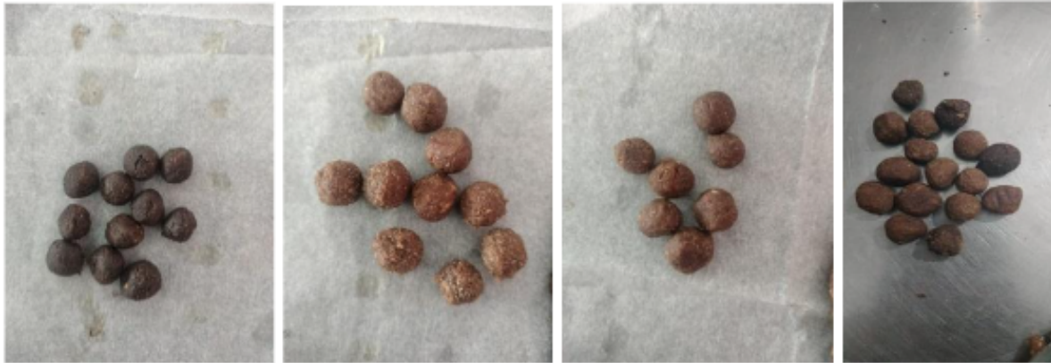
Figure 1: Prepared breakfast cereals from red banana with different variations sample A, B, C, control respectively