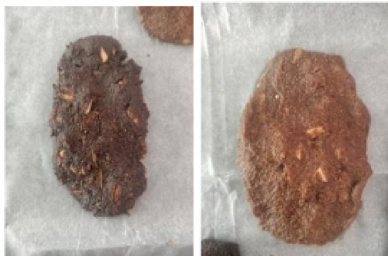
Figure 2: Healthy bars prepared from red banana incorporated foxtail tail millet and pumpkin seed.