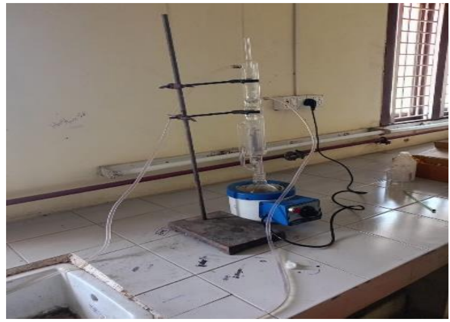
Figure-3: extraction of Emblica officinalis fruit