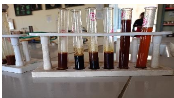
Figure-4: chemical test