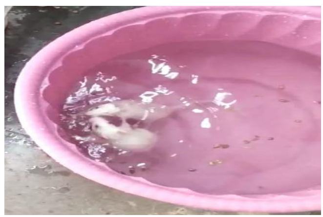
Figure-5: forced swim test