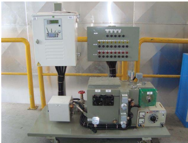
Fig. 3 Transformer Monitoring Test System

The knowledge level of the switch to read the information from TMS board level signal is provided on the resistance output module card (There are 10 \Omega resistor at each level.). This situation simulates the resistance output module are mounted on the board. Step information on the movement of the shaft by inserting the shaft lever switch satisfies the card is intended to change the level.