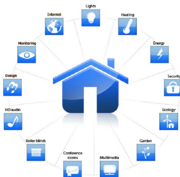
Fig. 1 Display of Typical Home Systems

This paper proposes the development of the interface ConductHome meant to simplify the interaction with a home automation environment.