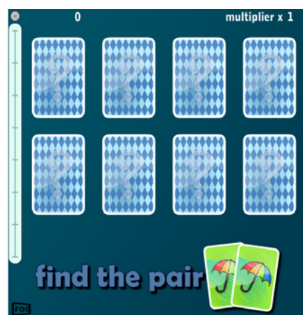
Fig. 3 Concentration Ability Training Game

However, it should be noted that behaviors indicating haste, such as hasty responses to the tests, have sharply risen after the main intervention, while behaviors that indicated that the participant was ignoring the instructions given were almost non-existent in the post-test phase.