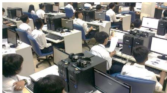
Fig. 3 Thai Students participation on the training program