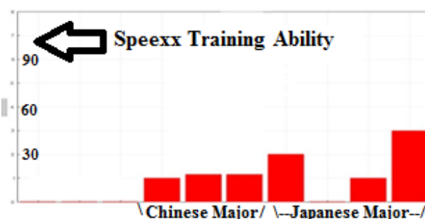
Fig. 4 Thai student ability results on Speex Training Program