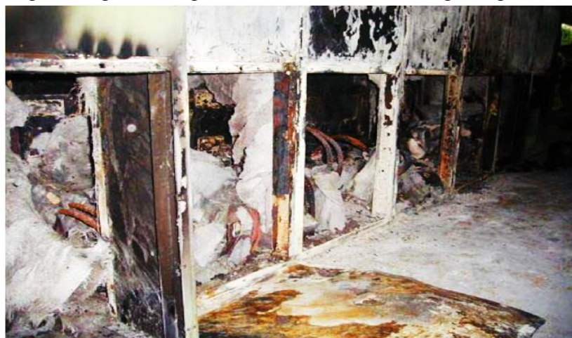
Figure 1. Box of damaged transformers

According to statistics, in various accidents in 6-35kV networks, PVTs account for about 80% of the damaged equipment. At the same time, about 10 per cent of installed PVTs are damaged annually in earth faults and FR. Practice confirms that FR between the network capacitance and the non-linear inductance (NI) of the transformer is often the cause of damage. As a rule, FR leads to overvoltages on the network busbars, and inadmissible currents flow through the PVT high voltage winding, which leads to their damage (Fig.1) [1-3].