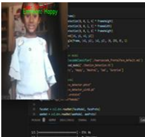
Fig 1: Result Image