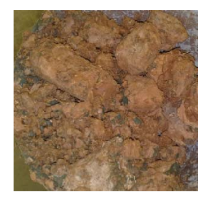
Fig. 2 Chosen waste under catalogue code 19 02 05

The chosen waste is ta neutralization sludge, which can be characterized as waste produced after neutralization of waste acids from various industrial processes containing dangerous substances.