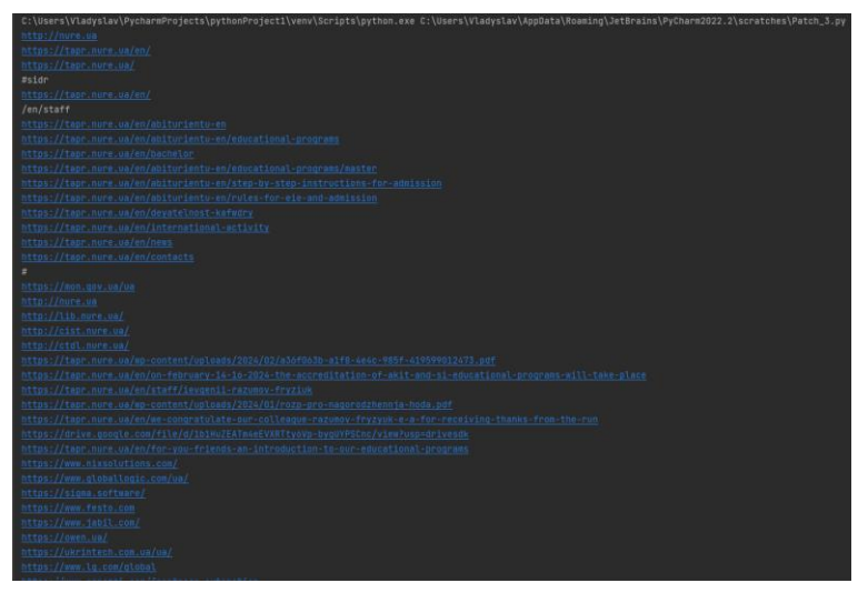
Figure 3: Results of parsing the Web site https://tapr.nure.ua/en/