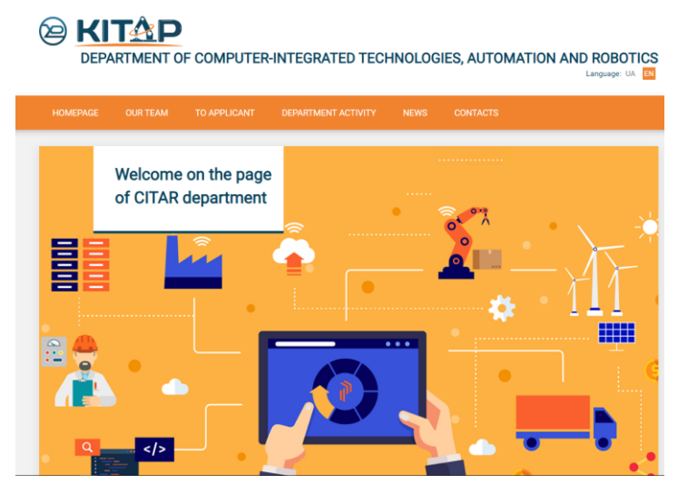
Figure 2: General view of the Web site https://tapr.nure.ua/en/

This code snippet displays an error message if the response from the server has a status code other than 200. Otherwise, if the status code is not 200, an error message is printed and the status code itself is provided as additional information to the user. This approach allows you to track errors while retrieving a page and provides a convenient way to debug if you encounter problems retrieving data from a website. A general view of the Web site https://tapr.nure.ua/en/ taken to study parsing methods to analyze the structure of the Web site and all links and URLs is presented in Figure 2.