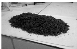
Fig. 2 The powder of sage

The harvested leaves are dried in the shade for a week in a dry and ventilated place, then ground using a grinder. The powder is placed in airtight jars and stored dry (room temperature) and to protect from moisture (Fig. 2).