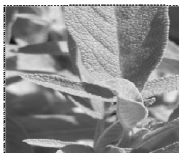
Fig. 1 Sage leaves

Sage likes dry soils with good calcium intake, located in hot, sunny and protected from the wind. Indeed, sage is grown from seed in spring. The leaves are harvested in the summer [10].