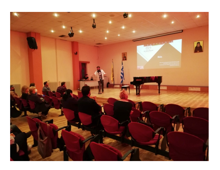
Pilot 8 Vjosa valley, the shared river (Albania)