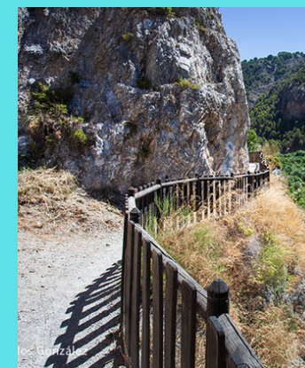
Sendero Aceguia de la Pavilla, Nigüelas

A través del proyecto INCULTUM (Visiting the margins: INnovative CULtural ToUrisM in European peripheries) proponemos la recuperación y revalorización de elementos hidráulicos relacionados con los sistemas históricos de regadío en el Altiplano de Granada. Convertiremos algunos de los caminos existentes contiguos a las acequias en rutas culturales. Estas. estarán vinculadas a la producción agraria local, el patrimonio rural, las prácticas tradicionales servicios los ecosistémicos.