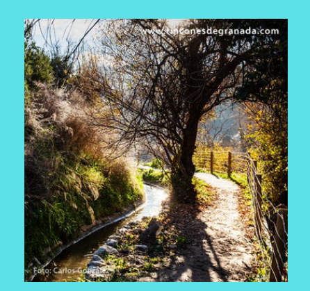
Sendero Acequia del Albaricoque, Monachil

Las Comunidad de Regantes son quienes gestionan estas aguas de manera comunal, siendo los principales actores para la preservación de estos paisajes y sistemas de riego.