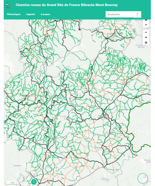
Pilot 6 Regional Park of Morvan-Bibracte (France)