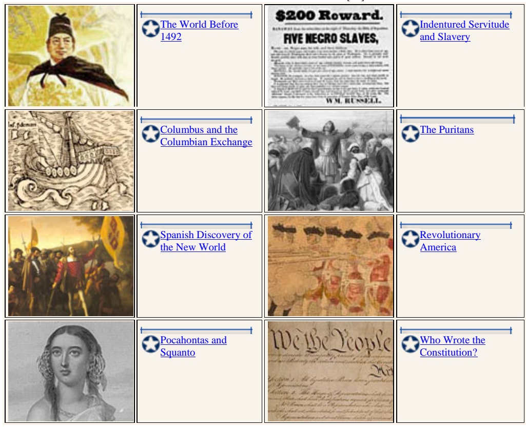
TABLE I UNIT 1 COLONIZATION AND REVOLUTION [16]

Teachers can try new methods, and experience what it means to teach and learn in the 21st century should be established. University is an important partner, in this case, to accompany and evaluate experiments and technological innovation. Will introduce teacher education delivered blended learning, combining technology-based materials and face-to-face conversation. Combined with professional content production and production by the teacher will be an important task, need to identify and open source materials. Learning objectives and outcomes should be changed to reflect the acquisition of skills and abilities. In order to assist students to achieve the objectives and learning outcomes, we need theory with practical examples from the area. This will result in the examination and assessment of style student performance changes affects the entire education system. It will be a challenge, affecting their outdated experience, as a student, to solve the main decision-makers.