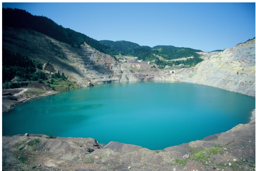
Figure 4: Smreka open pit iron mine in Vareš, Bosnia and Herzegovina, the second ¡VAMOS! test site (photo by Gorazd Žibret).

formation”). The uniaxial compressive strength of rocks found in Smreka pit varies between 44 and 80 MPa.