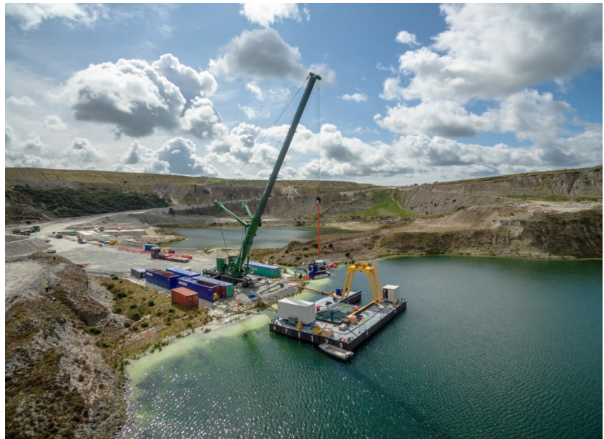
Figure 3: Site preparation for the first field trials in Lee Moor, Devon, UK (September 2017).

The second test site is the abandoned open-pit iron mine Smreka in Vareš, Bosnia and Herzegovina ( Figure 4 ). The ore minerals are massive and layered siderite and hematite which are locally silicified (Operta and Hyseni, 2016). The iron-rich layers dip steeply towards the north. This deposit formed as a hydrothermal replacement of the host rocks – limestone and dolomite. The hydrothermal fluids entered the area through a strike-slip fault of regional importance. The southern footwall of the ore body is breccia limestones of Jurassic age, while the north wall is composed of siliceous slates, shales, and slates (“Werfen