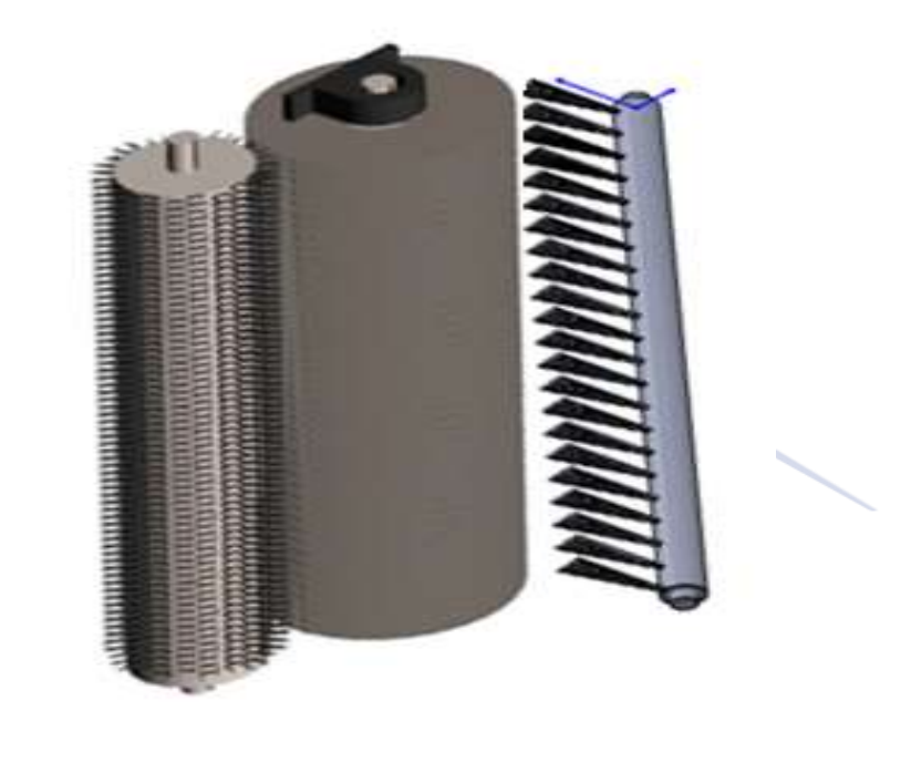
Figure 2. Improved CHX-3M2 large debris removal equipment

technological parameters: cleaning efficiency, seed damage, and waste fibre.