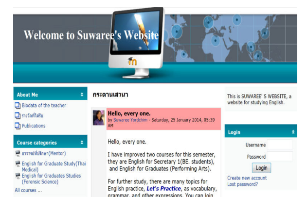
Fig. 1 Online system homepage

The website is provided at www.ssru.ac.th/teacher/suwaree. It shows the homepage, discussion web board, assessment report of overall course grading, and bar graph of number of students achieving grade ranges as the Figs. 1-4 below: