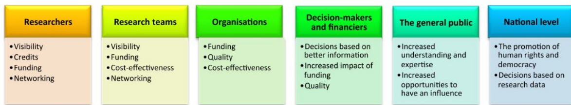
Figure 3: Stakeholders in Open Science. 7