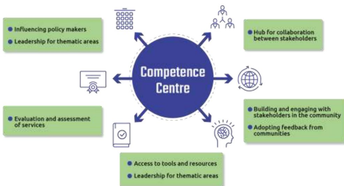
Figure 4. FAIRsFAIR summary of competence centres features (based on the characterisation of 36 competence centres, (adapted from Herterich et al., 2019, p. 9)

(adapted from Henckens et al., 2019, Meyer et al., 2019, European Commission, 2021, and internal Skills4EOSC project material)