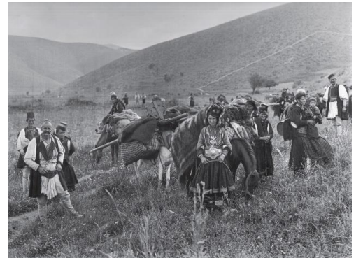
Vlachs nomadic journey early 20th