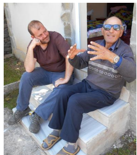
Interviewing the elderly Vlachs

Several interviews were conducted with the elderly Vlachs , which enabled to record and map the historical nomadic itineraries as well as locate the seasonal summer and winter settlements along the landscape of the south-east Albania.