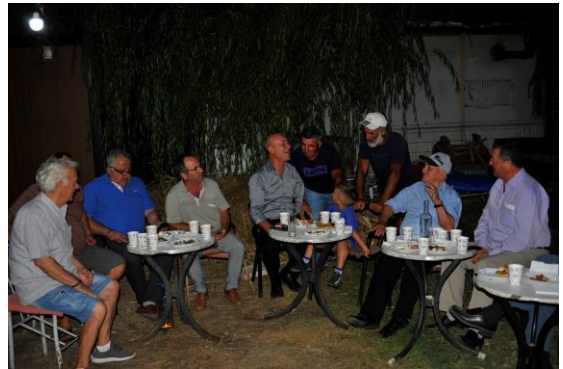
Encounters with the Vlachs of the valley

Another larger assemblage took that place during late July 2022, involved a wider participation of local stakeholders and tourists, where Vlachs were offered the chance to demonstrate aspects of their culture , including the interpretation of folklore songs, stories and poetry in their own language. This is considered an important step that may lead towards the institutionalization of a Vlach's annual celebration day in the valley.