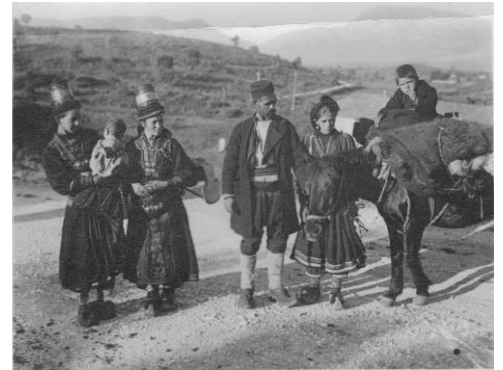
Historic picture in of the early 20th

During the Medieval era, Vlach families began to permanently settle in the mountain areas to the east of the Upper Vjosa valley, ultimately losing their nomadic aspect of life, but not the language. A larger Vlach settling in the valley occurred after the 50's of the last century, and several families were permanently set in villages of the valley.