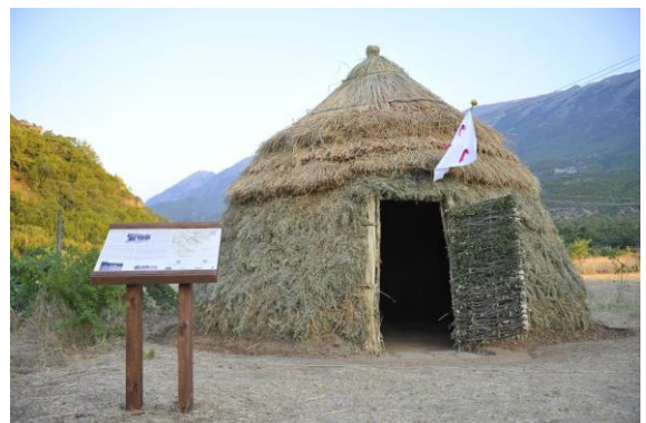
The final view of the dwelling site

The construction itself was a sharing experience and a learning process that involved elderly Vlach people, researchers, young specialists and local volunteers, allowing therefore the past masters techniques to be recorded and transferred to the new generation. It employed a multidisciplinary approach that combined together culture memory, experimental archaeology and tourism .