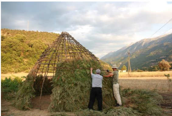
During the reconstruction of the kalive

The dwelling site consists of the Vlachs authentic nomadic dwelling type – the kalive , representing a simple, circular structure built of wood and covered with thatches. It was reconstructed during July of 2022, in a camping site set just outside the town of Përmet, which is a highly frequented destination by both foreigner and domestic tourists. The location is significant as it corresponds with one of the Vlach’s temporary daily camps set during their seasonal transhumance movements towards summer and winter pastures. The dwelling exemplifies the living history of the Vlachs people that survives due to the detailed memory retained by those individuals who once lived in pastoral transhumant societies across the landscape of Upper Vjosa valley. It was constructed using the same techniques and materials that Vlach builders used in the past, which was acquired in the surroundings of the area.