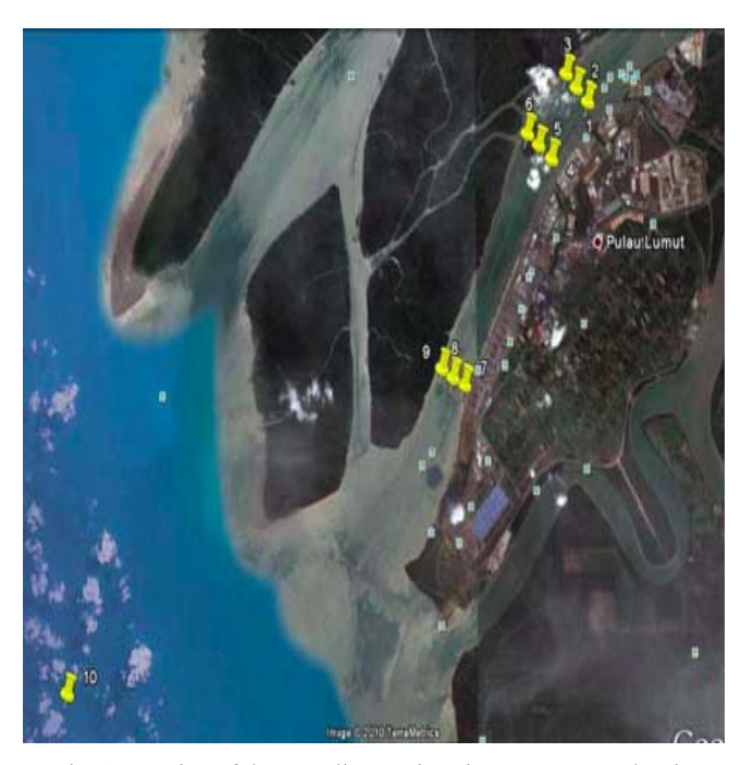
Fig. 1 Location of the sampling stations in West Port Malaysia

Statistical analyses were performed using Microsoft Excel and SPSS 17 software (SPSS, Chicago, IL). Significant difference from each group was evaluated via Kruskal-Wallis one-way nonparametric ANOVA (level of significant is 0.05). Nonparametric correlation method (Kendall's tau-b) was used to obtain the correlation coefficient among physicochemical parameters in water and sediment.