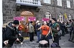
Icelandic financial crisis protesters