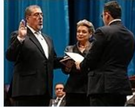
Bernardo Arévalo taking the oath of office

Ongoing: Israel–Hamas war (Houthi involvement) · Myanmar civil war · Russian invasion of Ukraine (timeline)