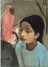
The Little Girl in Blue

Archive · Start a new article · Nominate an article