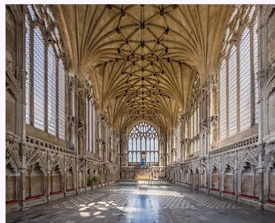
Today's featured picture

Ely Cathedral is an Anglican cathedral in the city of Ely in Cambridgeshire, England. The cathedral can trace its origin to an abbey founded in Ely in 672 by St Æthelthryth (also called Etheldreda ). The earliest parts of the present building date to 1083, and it was granted cathedral status in 1109. Until the Reformation the cathedral was dedicated to St Etheldreda and St Peter , at which point it was refounded as the Cathedral Church of the Holy and Undivided Trinity of Ely. It is the cathedral of the Diocese of Ely and seat of the Bishop of Ely . Ely Cathedral was built in a monumental Romanesque style, with the galilee porch , lady chapel and choir later rebuilt in an exuberant Decorated Gothic . Its central octagonal tower and the West Tower give it a prominent position above the surrounding flat landscape. This photograph shows the cathedral's lady chapel.