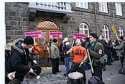
Icelandic financial crisis protesters