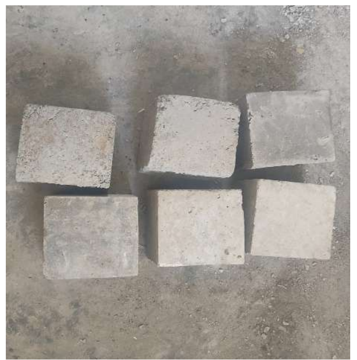
Figure 2:- Cube Specimens.