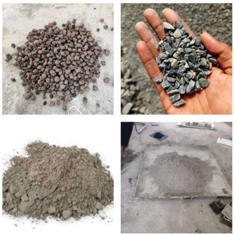
Figure 1:- Materials required.

with the help of trowel and was left for 24 hours allowed the concrete to set. The specimen were remolded after 24 hours.