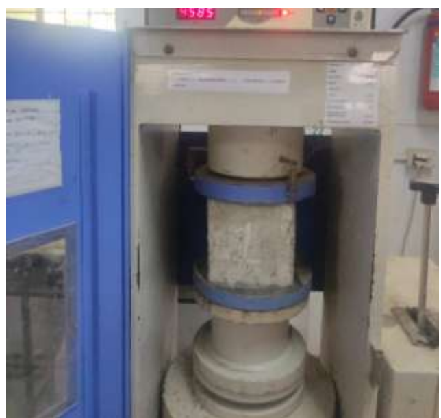
Figure 5:- Compressive Testing.