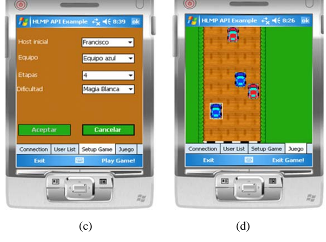
Fig. 3 The MagicRace game interface

The game user interface includes four tabs that are shown at the bottom area of that interface: connection , users list , setup