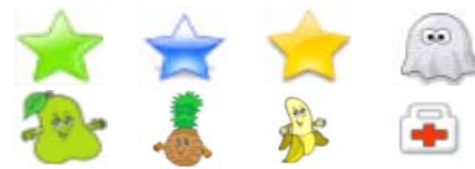
Fig. 2 Magical objects in the "positive personal" category

categories affect the whole team. Fig.2 shows the positive personal magic objects.