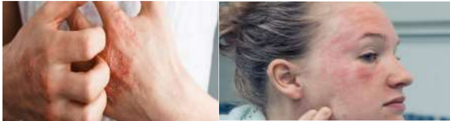
Figure 3: Skin problems due to persistent exposure to harmful chemicals

Heart related issues: circulatory issues, cardiac damage, Cardiovascular dysfunction