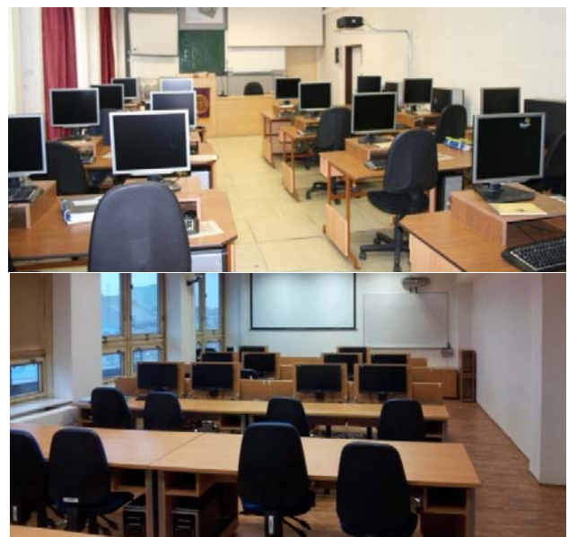
Fig. 2 Other specialized work place for testing Flexible Communication Platform

The task originates from the need to define the activities in the frame of emergency management. It comprises the reconstitution of affected/damaged communication area into a stabilized level, like the ensuring of basic functions in given area, i.e. properties serving for communication, for data exchange, for interoperability etc. The problem will also comprise not only how to stabilize the area but the creation of conditions for further development of communication security area [13]. The test Specialized Classroom (Fig. 1) is connected to other specialized workplaces, among which a testing and exchange of information and data. These are shown in Fig. 2.