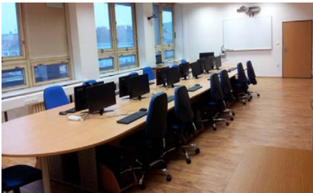
Fig. 1 Specialized Classroom for testing Flexible Communication Platform

There are many research institutes dealing with science and research in communication technologies. They toy with the question of the use of common security technologies and other security options that use the principle of COTS (Commercial Off The Shelf) [1] as much as possible. That means the maximal utilization of commercial products and services to create a specific system or technology [9], [13]. An example is the testing workplace. That is implemented with minor changes in specialized classrooms of Department of Civil protection. This can be seen in Fig. 1.