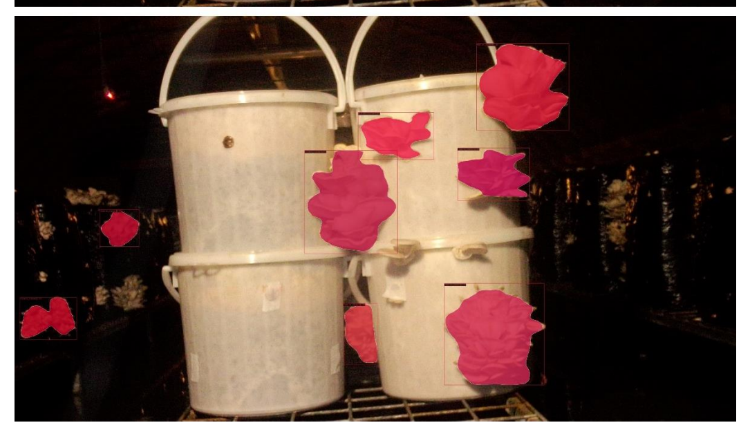
Figure 2. Mask R-CNN based detection of mushroom clusters on a new timelapse dataset for validation.