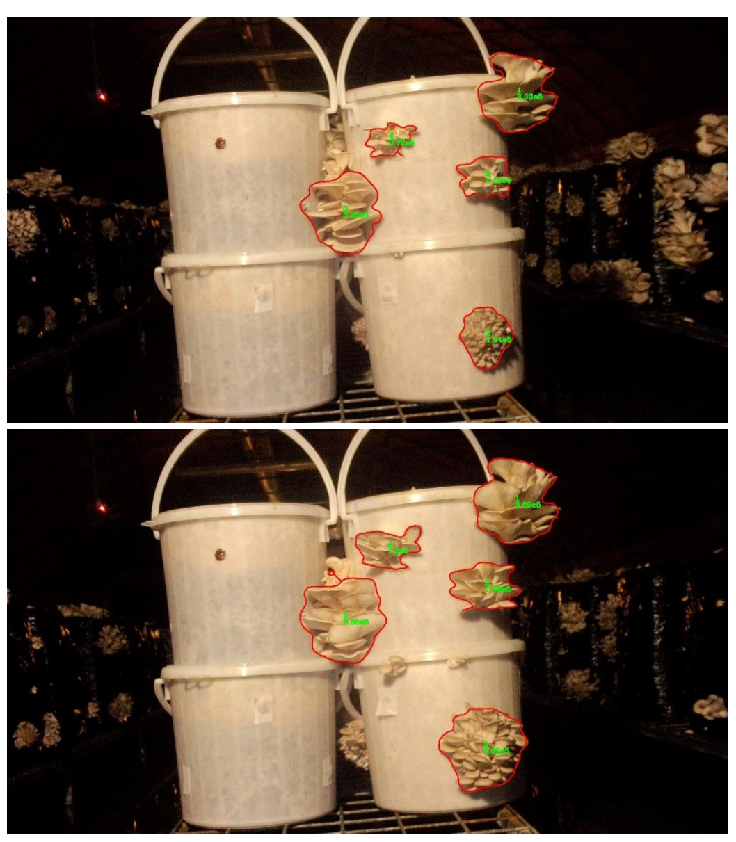
Figure 3. Implementation of the tracking algorithm at selected timesteps of mushroom growth.

The timelapse application aims to track the growth of mushroom clusters in a series of timelapse images. The use of pixels as a substitute to "measure" mushroom growth in these images is a promising method of tracking growth. The two image subsets were captured using the same camera and having the same image size (6080 pixels width x 3420 pixels height). However, in order to reduce any discrepancies when comparing between image subsets, the number of pixels per cluster is normalized over the total number of pixels in the images so that the cluster "size" represents a percentage of the total size of the image instead of the absolute number of pixels. The real size of each individual pixel in this case would differ between the two subsets and would not offer insight into the actual size of the mushrooms but an analogue by which to track cluster growth within each subset of images. Figure 3 shows two representative timesteps, with the corresponding numbers of the detected clusters at their center.