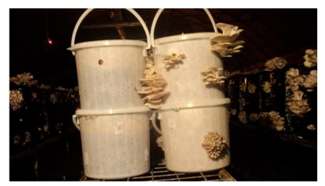
Figure 1. Validation dataset: Production trials of oyster mushrooms grown on the MUSHNOMICS substrates.