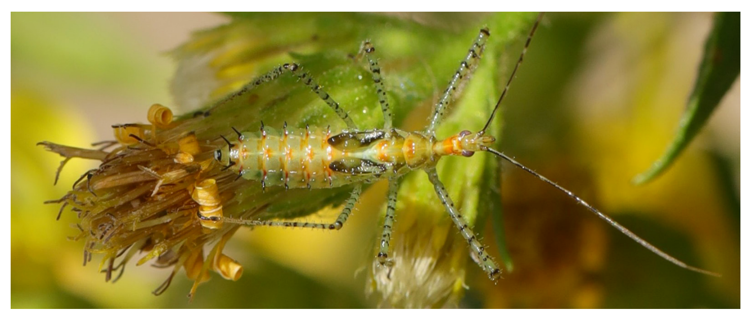
Photograph of Zelus renardii by N. Vicens (2023)

Figure 3. Feasibility of the management strategy's goals grouped by categories (i.e. Policy, Research, Public awareness and Biosecurity) in each scenario as judged by AlienScenarios and InvasiBES participants. Find more details in [7].