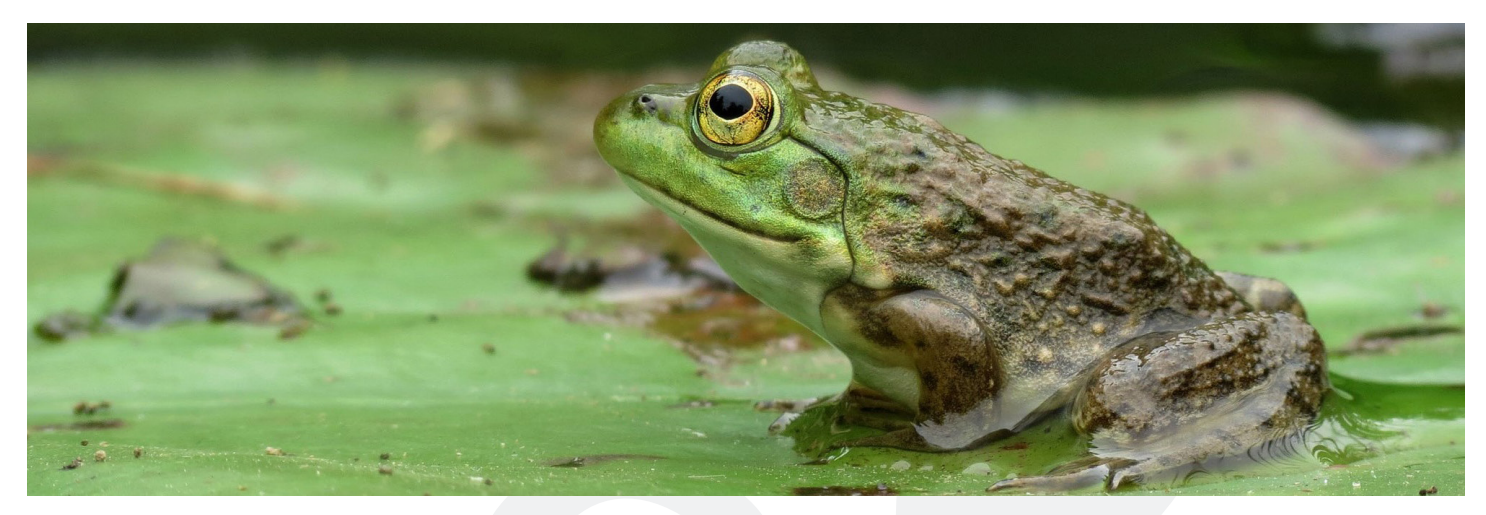
Photograph of Lithobates catesbeianus by K. Schulz, licenced under CC BY 2.0. Image cropped from the original photograph.

Qualitative scenarios offer the flexibility to explore different potential futures considering a broad range of socioecological factors. They are not predictions; rather, they are narratives descriptions or stories that portray what might happen in the future. Despite their widespread use, commonly employed future scenarios, like the Shared Socioeconomic Pathways developed by climate change researchers [4], frequently overlook crucial factors driving biological invasions. Neglecting these factors results in an underestimation of future biological invasions and, consequently, biased forecasts of biodiversity changes.