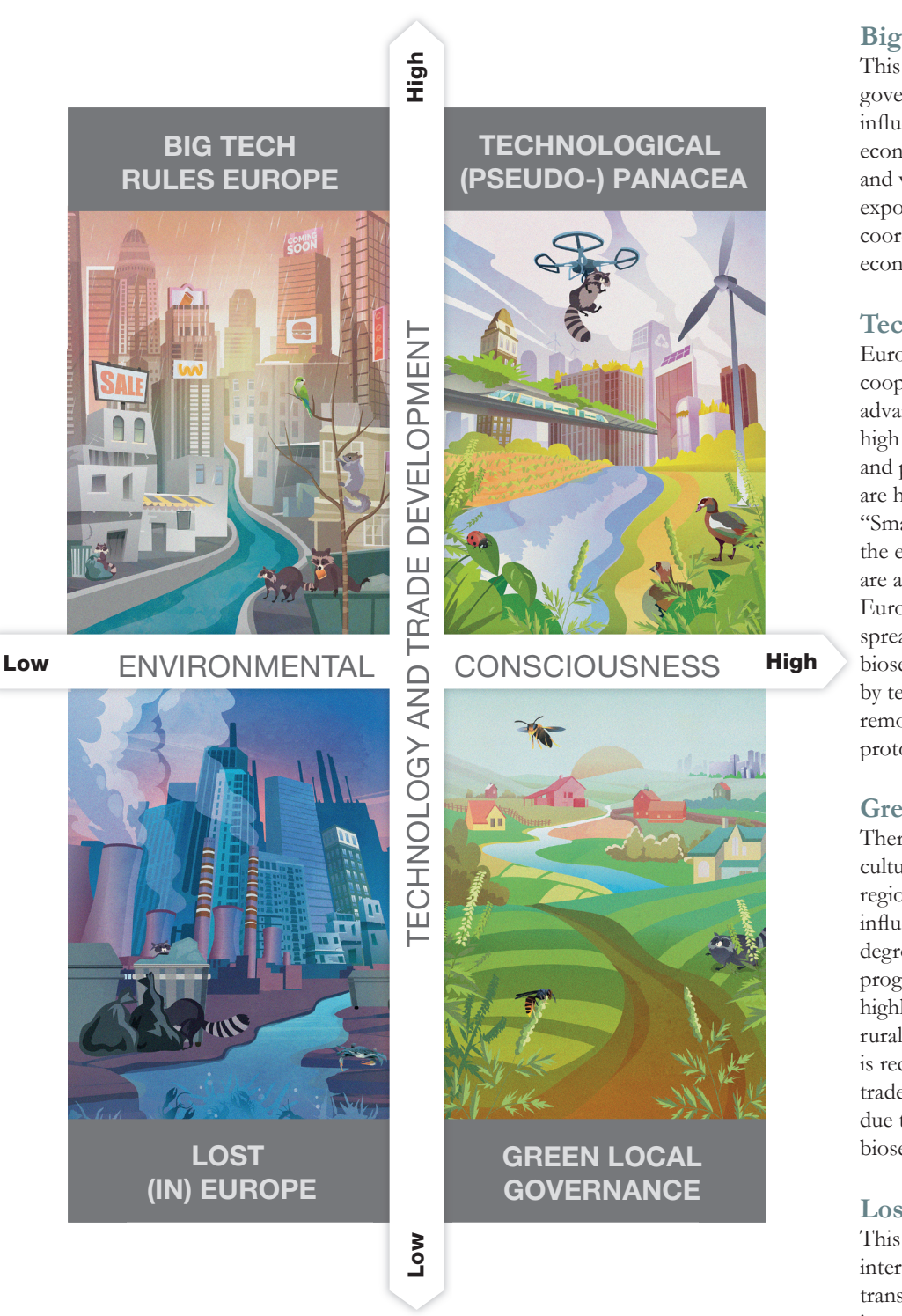
Figure 1. Artistic illustrations of the four future scenarios for biological invasions in Europe. Illustrations created by Kris Tsenova (Paidia Consulting Ltd). Find more details in [6].