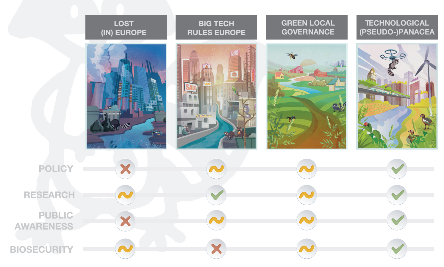
Figure 3. Feasibility of the management strategy's goals grouped by categories (i.e. Policy, Research, Public awareness and Biosecurity) in each scenario as judged by AlienScenarios and InvasiBES participants. Find more details in [7].

sufficient to fully achieve the strategy's vision, their inclusion is an essential step to deliver a long-term strategy that is better prepared for future developments.