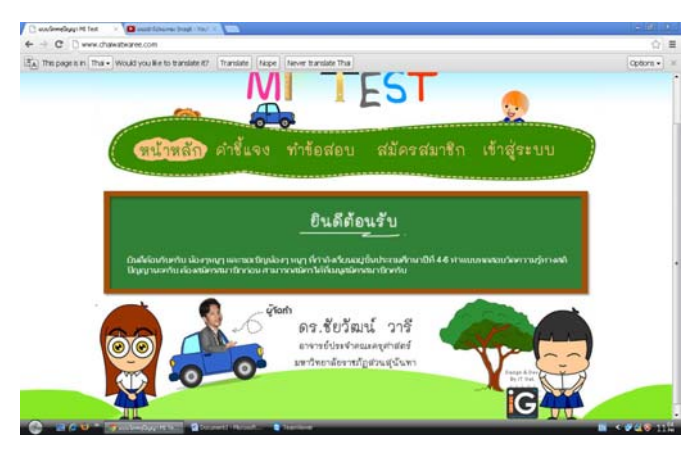
Fig. 2 The Multiple Intelligences Measurement Online