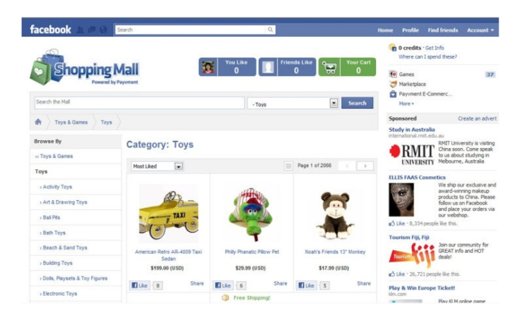
Fig. 3 The Payvment Social Mall on Facebook

Payvment created the previously mentioned platform for businesses to open shop on what it calls a social mall (or social shopping mall). In February 2011, the first month of opening, Facebook signed over 50,000 retailers, mostly small retailers and many are independent clothing manufacturers. Initially, there were 1.2 million items on display. The mall starts with a display of products that friends in your Facebook network have liked and recommended. That will help shoppers find items they might not have known about before. It is like going shopping with your friends.