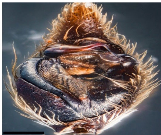
Fig. 6. Ventral palp of Wadicosa fidelis (O. Pickard-Cambridge, 1872). Scale bar 0.5 mm.

Comment. In Iraq, this species was previously reported from Salahaddin Province (Reimoser, 1913), Baghdad, Karbala (Baker & Ali, 2020) and Basrah (Najim & Al-Hadlag 2022).