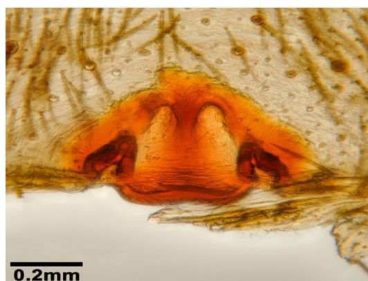
Fig. 4. Pre-epigyne of Hogna effera (O. Pickard-Cambridge, 1872). Scale bar 0.2 mm.