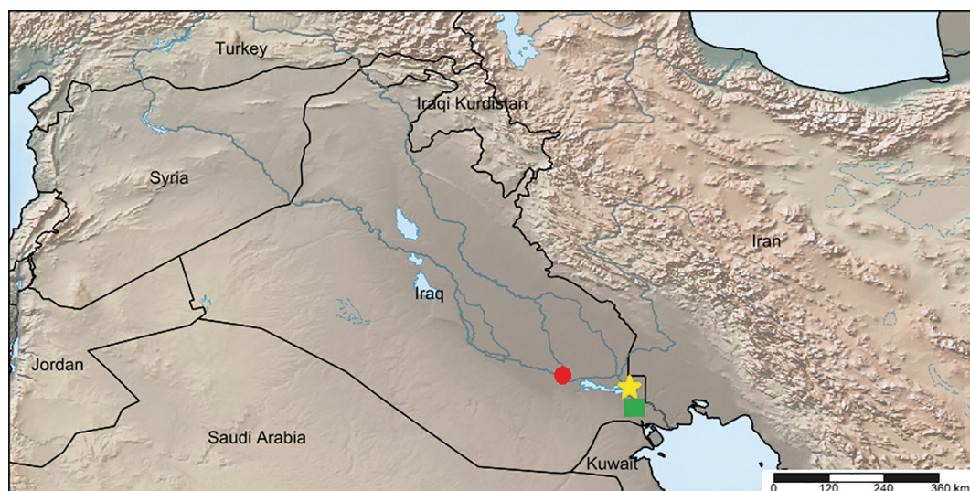
Fig. 1. Map of collection localities: Thi Qar, Ur district (red circle); Basrah, Qarmat Ali, Al Mashab (yellow star); Basrah, Qarmat Ali, Al Khait (green square).