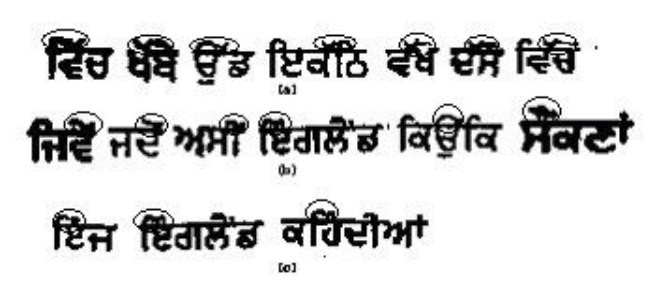
Fig. 5 Gurmukhi words containing touching characters in upper zone (touching characters have been marked with circles)

Following three categories are being proposed in the upper zone for touching characters.