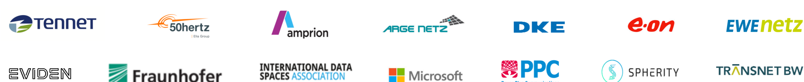
Figure 2: Project consortium of energy data-X

The project energy data-X is led by TenneT TSO GmbH and funded under the 7 th energy research programme. It is a three-year project that has started in October 2023. The consortia is distinguished by the inclusion of all four TSOs in Germany, showcasing a unified effort across the national grid. Alongside these key network players, the project engages metering OEMs, energy suppliers, research institutes and many more (see Figure 2), creating a multidisciplinary team focused on exploring the potential of Data Space technology for the energy sector.