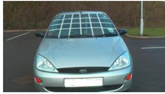
Fig. 3 Marking out 24 windscreen cells

The windscreen of a Ford Focus car was divided up into 24 cells consisting of 4 rows of 6 columns. Figure 3 shows an image of the car with the windscreen cells marked out with masking tape.