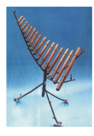
Fig. 7 T'rung - Đàn T'rưng Troung Ngoc Thang : Traditional Musical Instrument of Viet Ethnic Group

Vietnamese Wind instruments are Khen Mong, K'long Put, Sao, Ken Bau, Tieu, Sao ngang, Tu va.