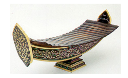
Fig. 3 Ranat Ayk

Third, Thai percussion instruments consist of Ranat Ayk, Ranat Thum, Ching, Chap, Hhawng Wong Yai, Hhawng Wong Lek, Glawng That, Taphon, Thon, Rammana, Glawng Khaek, Sawng Na.