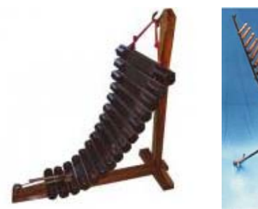
Fig. 9 Pong Lang http://pongrang.com/ web/product.php [6]

There are some kinds of musical instruments which are similarity between Thailand and Vietnam, for example, Pong Lang in Thailand and T'rung - Đàn T'rung in Vietnam, Saw U and Dan Gao, Khlui and Sao ngang.