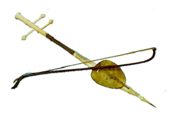
Fig. 2 Saw Sam Sai http://www.patakorn.com/modules.php [2]

Second, Bowed strings instruments in Thailand are Saw Sam Sai, Saw u, Saw Duang, Salaw.