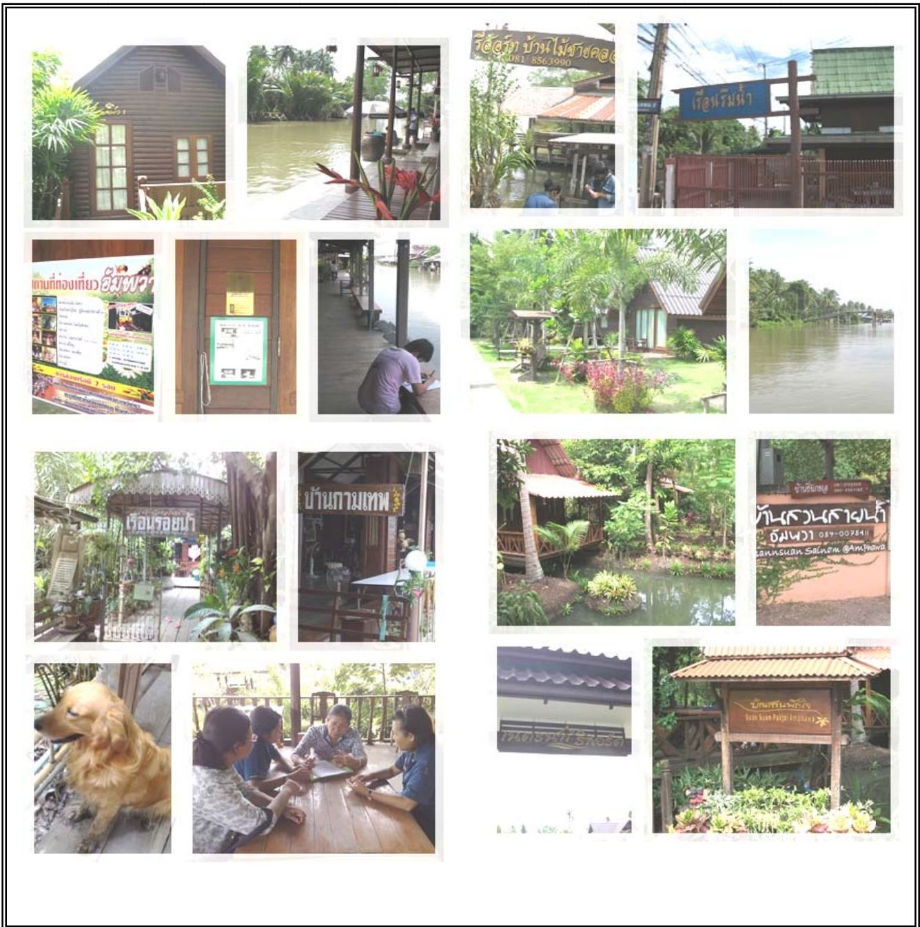
Fig. 2 Tourist Accommodations in Amphawa

Moreover, the location of tourist's accommodation is situating nearby the riverside, where is very sensitive to discharge wastewater, waste, chemical pollutants to natural water resources may occur if there is a lack of appropriate environmental management system. Therefore, this study aimed to initiate sustainable water management for tourist accommodations in Amphawa, Samut Songkram Province by evaluated wastewater characteristics from 10 tourist accommodations. Implementation of this study can be applied the mitigations to reduce contamination of water resources and protection natural resources which are the great assets for local