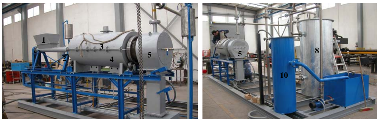
Fig. 2 Photographic views of the pilot plant (numbers are the same as Fig. 1)

jacket; this gas is produced during the plant starting up phase by LPG burners. The reactor internal temperature is maintained at a constant temperature near 500°C by a control system that regulates the flow rate of the gas sent to the burners. The pyrolysis gas coming from the reactor passes through an area of calm, where most of the inert particles and biochar are separated and discharged by means of a double dump valve (system 5 in Fig. 1 and 2). Then the gas is sent to a cyclone separator (6 in Fig. 1 and 2) where the residual solids are separated, after which it is cooled with water by an adiabatic quench system (apparatus 7 in Fig. 1) and purified into a wet scrubber (8 in Fig. 1 and 2); finally, after having passed through a flow device (10 in Fig. 1 and 2), the produced gas comes out to be burned. The conveying of the pyrolysis gas is made by a side channel blower (9 in Fig. 1 and 2) positioned in the process line between the scrubber and the flow device; it is regulated in such a way that the reactor is maintained with a slight depression (3-5 mm of water column).