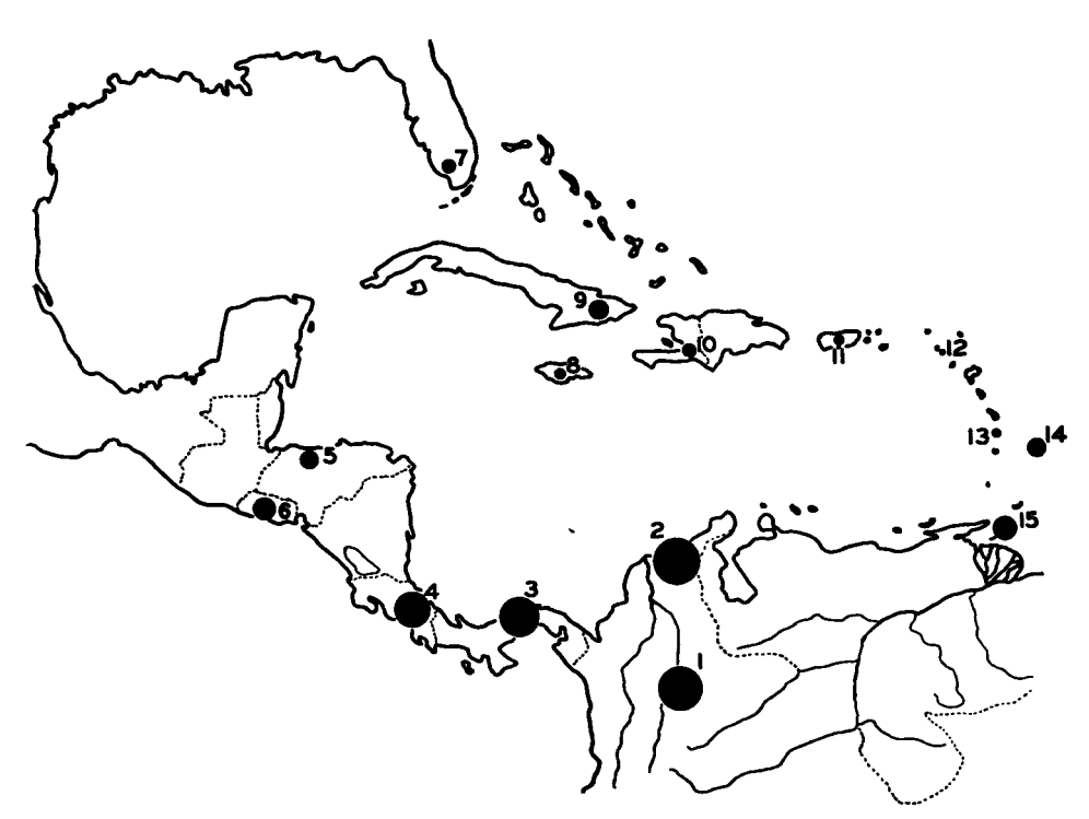
FIG. 1. Mean numbers of heterozygous inversions per individual of Drosophila willistoni in different populations, symbolized by the diameters of the black circles. The numbers of the populations correspond to those in tables 1-3. The South American part of the distribution area of the species is not shown in this figure.

islands on which the X-chromosomes do not vary in the gene arrangement. It can be seen that the lowest mean number of heterozygous inversions is found on the Isle of St. Kitts. This is, in fact, the lowest concentration of inversions known in the species D. willistoni (cf. da Cunha and Dobzhansky, 1954). The highest means in table 3 are those for Bucaramanga and for Santa Marta, Colombia. They are higher than those found in the Amazon Valley in Brazil, and are exceeded only by those from some populations of central Brazil.