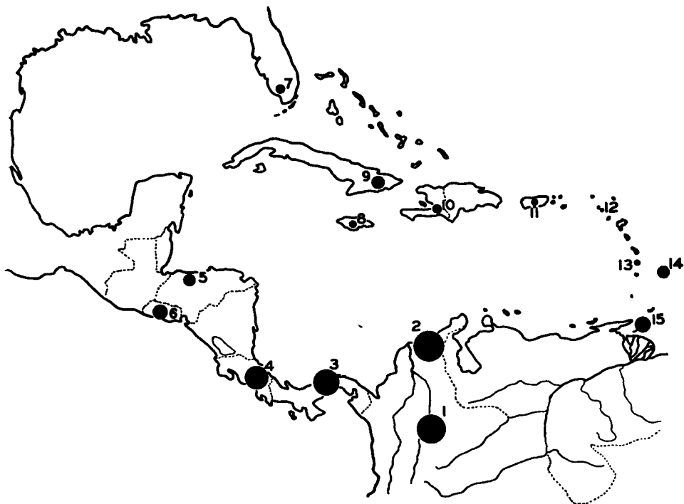
FIG. 1. Mean numbers of heterozygous inversions per individual of Drosophila willistoni in different populations, symbolized by the diameters of the black circles. The numbers of the populations correspond to those in tables 1-3. The South American part of the distribution area of the species is not shown in this figure.

islands on which the X-chromosomes do not vary in the gene arrangement. It can be seen that the lowest mean number of heterozygous inversions is found on the Isle of St. Kitts. This is, in fact, the lowest concentration of inversions known in the species D. willistoni (cf. da Cunha and Dobzhansky, 1954). The highest means in table 3 are those for Bucaramanga and for Santa Marta, Colombia. They are higher than those found in the Amazon Valley in Brazil, and are exceeded only by those from some populations of central Brazil.