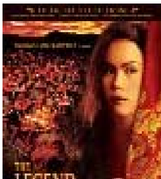
Fig. 3 Love of Siam (2007), Bangkok Traffic Love Story(2009), and Suriyothai (2001)