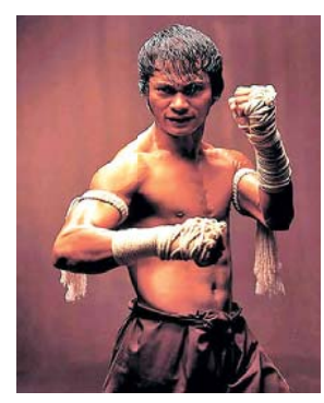
Fig. 4 Tony Jaa, a leading actor in Ong-Bak (2003)

From key informants' viewpoints, Thai directors would not become famous in the eyes of the audience but would be known in film festivals such as in Cannes, France. International audiences remembered the movie and the outstanding star instead. Stars or actors in some countries as England, Korea, Hong Kong, and Hollywood could be sold with the movies but not really in Thai movies.