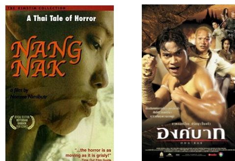
Fig. 1 Movies with Thai culture