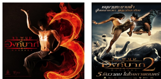
Fig. 2 Ong-Bak , an action outstanding Thai film in 2003