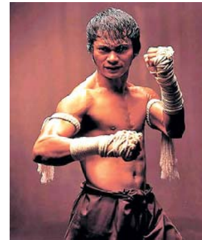
Fig. 4 Tony Jaa, a leading actor in Ong-Bak (2003)

From key informants' viewpoints, Thai directors would not become famous in the eyes of the audience but would be known in film festivals such as in Cannes, France. International audiences remembered the movie and the outstanding star instead. Stars or actors in some countries as England, Korea, Hong Kong, and Hollywood could be sold with the movies but not really in Thai movies.